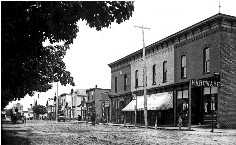
1890, the era of wood plank sidewalks, gas street lanterns, and no paved Bridge Street