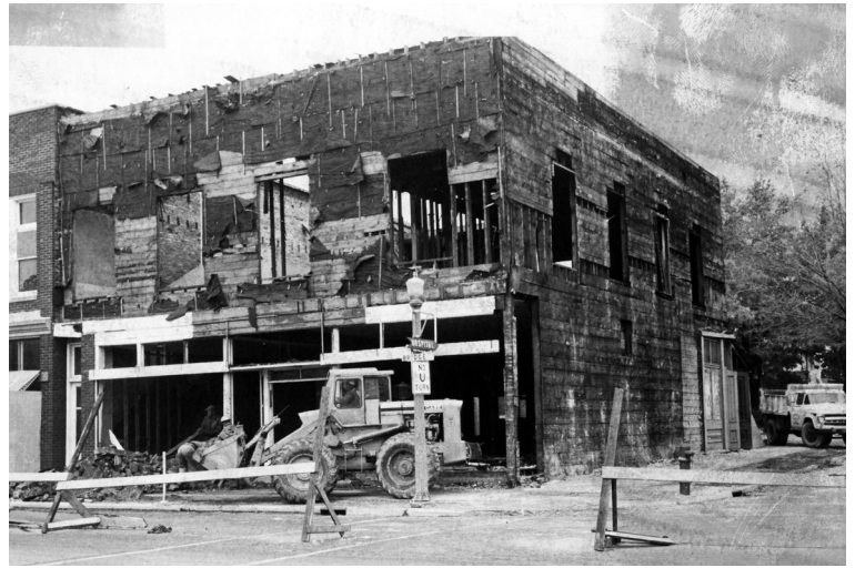
A Charlevoix Courier-proof photo of what was known as the Birkrandt building being demolished in the 1960s to make way for the brick structure there now.