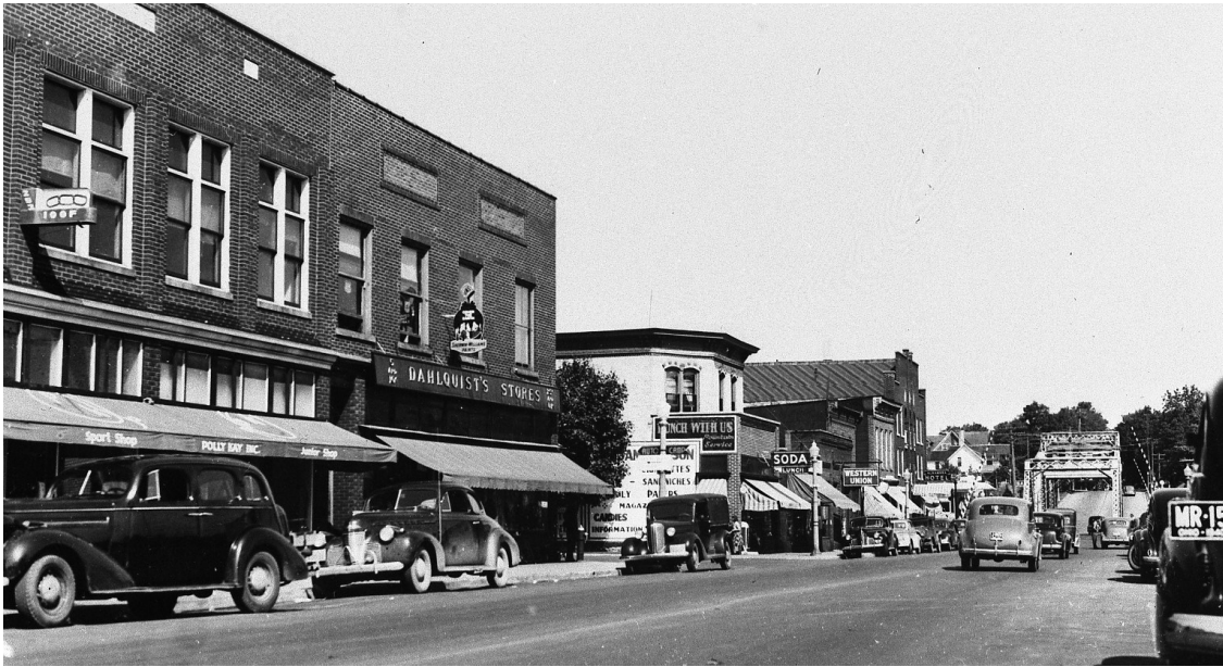
A 1940s view, with the same tenants in the buildings, now two separate structures without the connecting cornice ever since the rebuilding (see previous page).