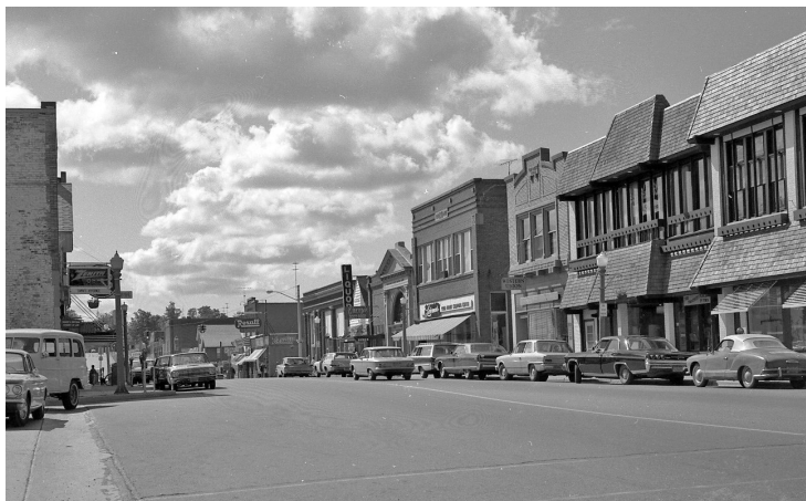
1970s, with faux-French fishing village facade cladding