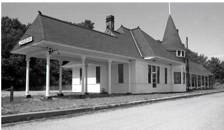
An all-white depot in the 1990s