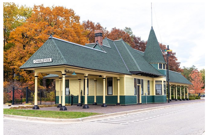
Repainted to its historically correct original colors, 2018