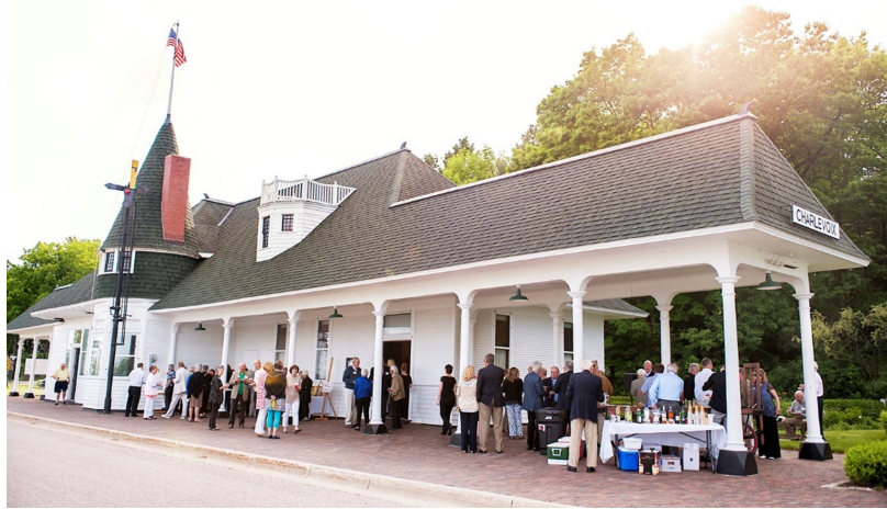
A Society social event prior to the 2018 repainting

Thus remains this wonderfully preserved singular legacy of Charlevoix's railroad history, protected since 2005 in its own historic district, the first in Charlevoix. In this venue the Historical Society hosts programs, exhibits, and special events, with availability to area non-profit organizations for meetings, receptions, etc. It is also available to those who join the Historical Society at a patronage level for private weddings, rehearsal dinners, post-wedding events, graduation parties, birthday parties, anniversary celebrations, et. al.