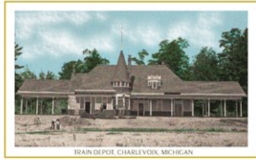
TRAIN DEPOT, CHARLEVOIX, MICHIGAN