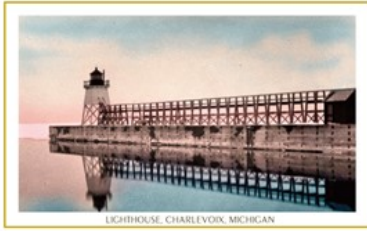
LIGHTHOUSE, CHARLEVOIX, MICHIGAN