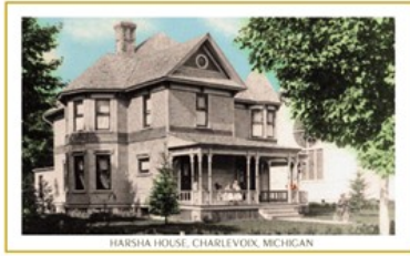
HARSHA HOUSE, CHARLEVOIX, MICHIGAN